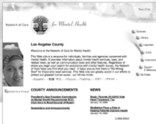
It's easy, even for beginners, to use Network of Care.

Network of Care is a comprehensive, Internet-based community resource for people with mental illness, as well as their caregivers and service providers. This easy-to-use Web site provides an extensive directory to put people in touch with the right services at the right time. It also offers vital information about diagnoses,